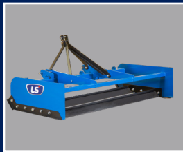
LAND GRADER Heavy steel construction, high strength designed for use in demanding applications