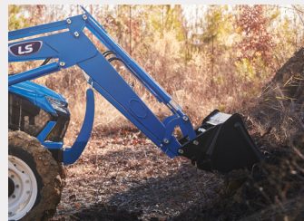
HIGH CAPACITY LOADER Increased lift capacity for heavy duty jobs.