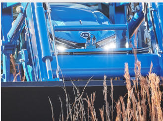
LED HEADLIGHTS For high visibility in low light conditions.