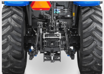
HIGH LIFT CAPACITY 3-POINT HITCH Powerful 3-point lift capacity to unleash your implements potential.