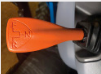
POWER SHUTTLE TRANSMISSION With electronic lever providing smooth and easy shifting.