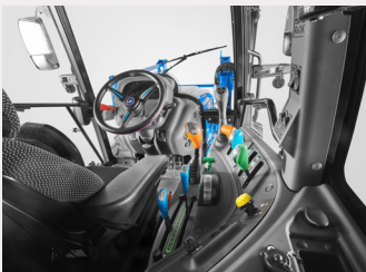
SPACIOUS PANORAMIC CAB Help equipment operators unlock greater productivity while taking on some of the toughest jobs.