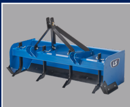
BOX BLADE Features a heavy welded steel design for use in demanding applications