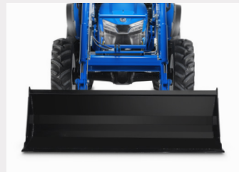
GRILL GUARD Standard with optional Loader to protect your equipment from debris.