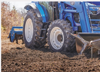
GOODYEAR LSW TIRES Help equipment operators unlock greater productivity while taking on some of the toughest jobs.