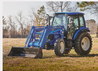
AGRESSIVE STYLING Upgraded, modern look where form meets function.