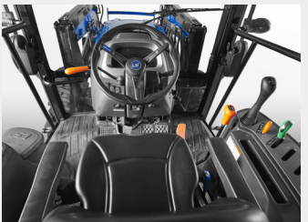
Wraparound Style Interior and Exterior Improved visibility