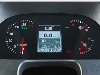
Standard TF-LCD Instrument Panel Shows Regen Time, oil change intervals and more