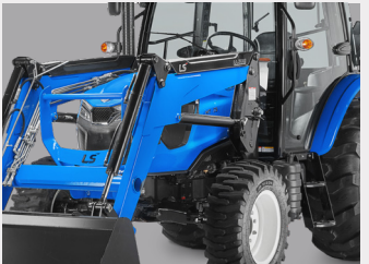
New LS Family Look Upgraded, modern look also provides better functionality