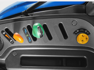
Knob Design Enhancement Refined controls make for easier operation