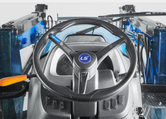
Enhanced Steering Grip Improved ease of operation