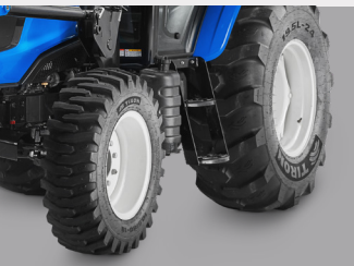
4 Different Tire Options Tires to match any application (Including new large Ag style)