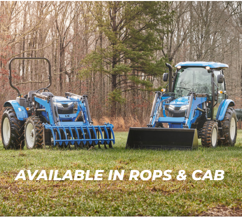
AVAILABLE IN ROPS & CAB

Note: Specifications and design are subject to change without prior notice.