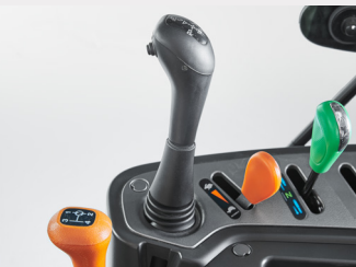
Standard 3rd Function Button on Joystick Easier and more cost effective when upgrading to 3rd option