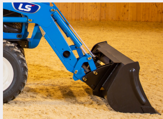
Loader Leveling Rod Enables operator to maintain bucket angle