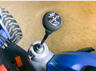
Integrated Joystick Provides comfortable access for loader operations