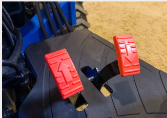
3 Range Hydrostatic Transmission 2 pedal comfortable and efficient operator control