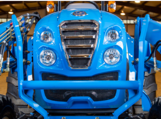
Standard Factory Grille Guard W/ Loader Full length grille guard protects body panels and radiator