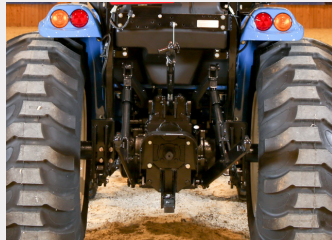
High Capacity Three Point Hitch Heavy-duty frame and lift cylinders enable three-point lift capacity up to 2,910 lbs