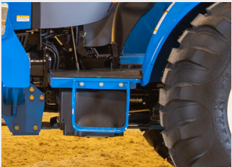
Accessibility Easy access platform via standard step and rubber matted surface