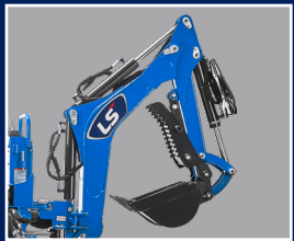
BACKHOE Excellent capacity, smooth and consistent operation for added control