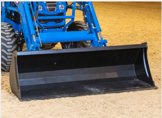
Deluxe Loader 2 lever skid steer coupler allows for universal skid steer attachments