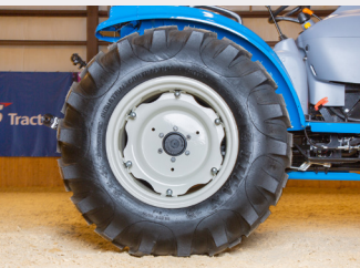
Standard Tires Choice of Ag, Industrial Or Turf tires at no additional cost