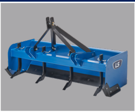
BOX BLADE Features a heavy welded steel design for use in demanding applications