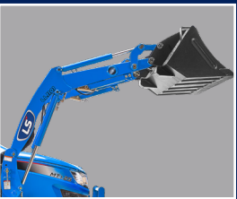
LOADER High capacity with an abundance of standard features