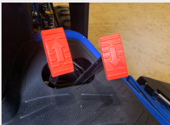
3 Range Hydrostatic Transmission 2 Pedal comfortable and efficient operator control