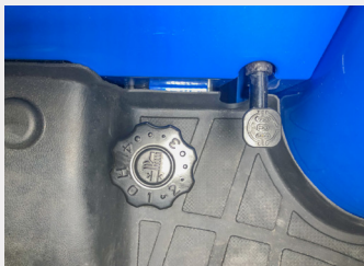
Mid-Mount Height Adjustment Dial Enables precise height control of the mid-mount mower by a single turn