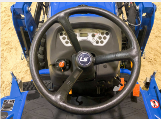
Standard Tilt Steering Provides enhanced operator comfort