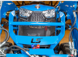
Standard Factory Grille Guard W/ Loader Full length grille guard protects body panels and radiator