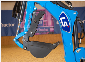
Durability And Capacity Provides added functionality to the heavy-duty backhoe