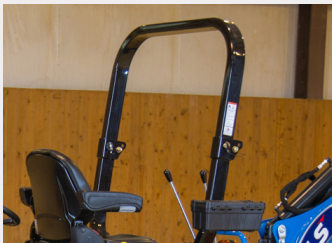
Standard Foldable ROPS Enables easy adjustment for clearance