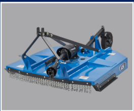
ROTARY CUTTER Durable heavy steel design providing quality and strength