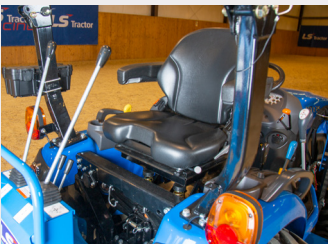
Premium Reversible Seat Adjustable foldable armrest, tilt high back seat. *Reversible seat only on backhoe models