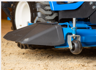
Optional Drive-Over Mid-Mount Mower Deck Providing convenience and ease of adapting to any application