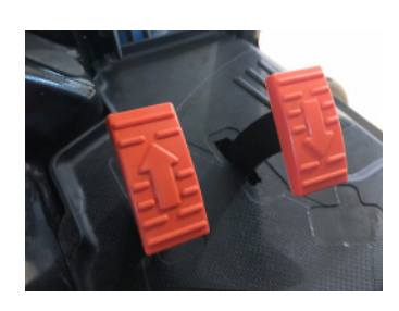
3 Range Hydrostatic Transmission, (2 Pedal) Comfortable And Efficient Operator Control