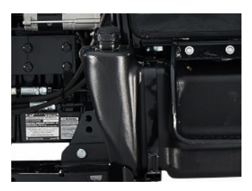
Ground Level Fueling Allow Easy Access For Fueling