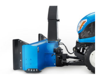
Front Hitch And Sub-Frame Capable Allow For Front Implements