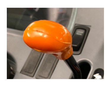
Linked Pedal Enables Throttle And Hydro Pedal To "Link" Enabling Efficient Engine Power Use