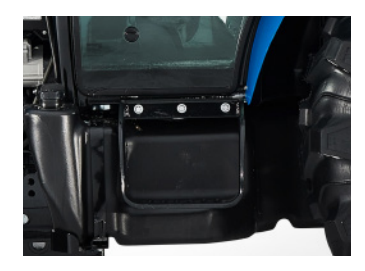
Standard Step Provides Ease Of Access To Platform