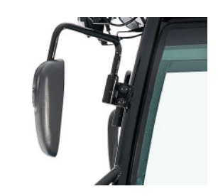
Standard Dual Mirrors Enhances Visibility